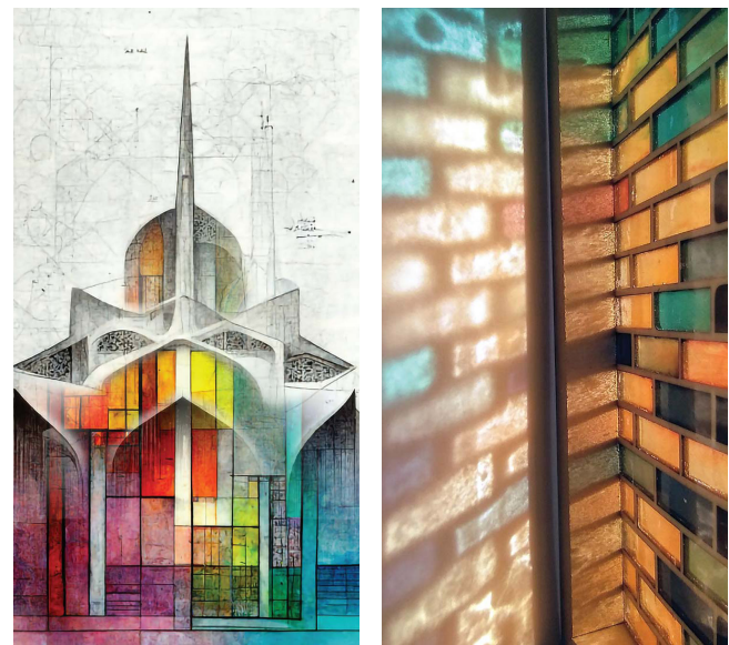
Figure 5. Comparative Visualization: Left - AI-Generated Geometry, Color, and Light Analysis of a Mosque; Right - Inspired Light Box Model By Samuel Kruger.

The bigger narrative of AI portrays it as a complement rather than a replacement for traditional design methodologies. Its capability for rapid idea generation proves its potential as a formidable tool for expansive design exploration. The incentive for digital integration emanates from AI's promise to stretch design range, acting as a stimulus towards uncharted design realms and novel conceptualizations. The efficiency it permeates within the design process liberates valuable time, affording students the luxury to delve deeper into specific design nuances.