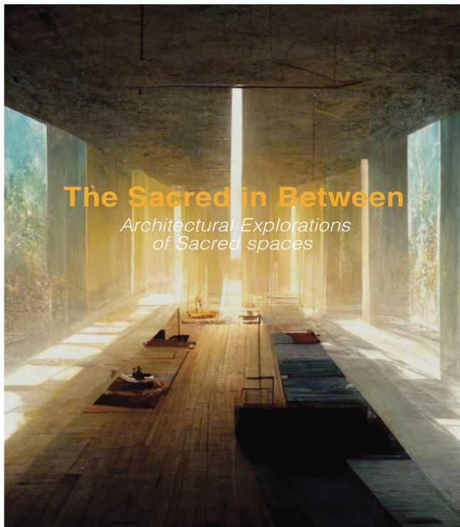
Figure 2. Course Syllabus Cover Page Generated by Midjourney AI. By Author

contexts and a field trip to an Abbey—a tangible exploration of sacred architecture.